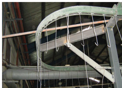
Spray Booth Conveyor